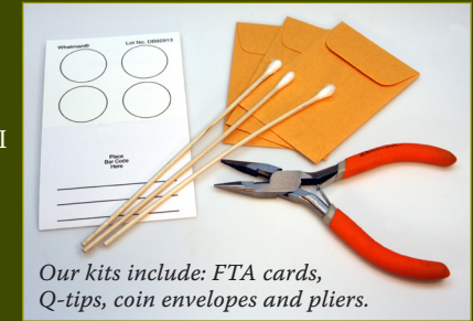
Our kits include: FTA cards, Q-tips, coin envelopes and pliers.

pulls hairs from the tip of the tail using pliers, making sure that follicles are attached. These hairs are then placed into the coin envelope. The card/envelope is numbered with the species code, sex, estimated age, GPS location and date of the collection. This information will be linked to SCI with trophy record archives. The entire collection usually takes less than two minutes.