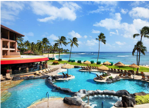
Ocean Side Pool