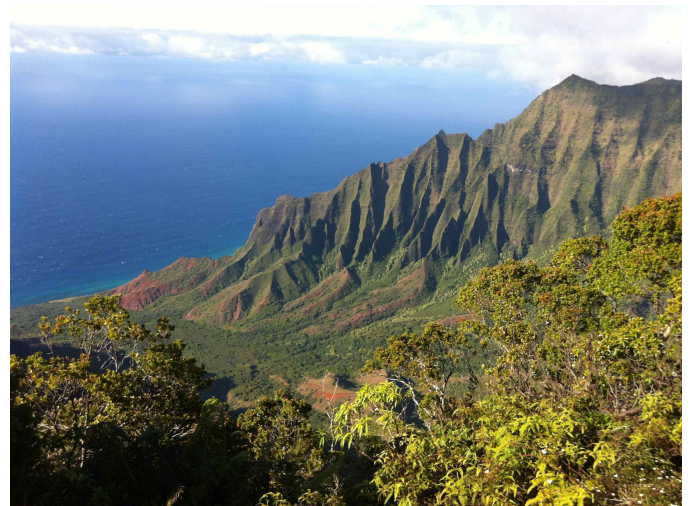
Napali Coast of Kauai