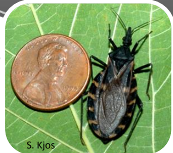
Triatoma gerstaeckeri Adult female

Please write down this information to send with the bug.