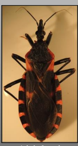
Adult female Triatoma sanguisuga