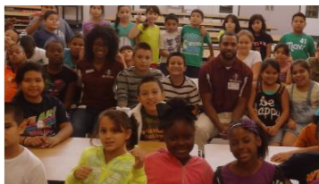
DVM African American delegates present to 75 4th graders in Bryan to do a rabies Presentation to 75 4th graders (Oct, 2014)

The Partnership for Environmental Education and Rural Health (PEER) K-12 program continues to promote the expansion of lessons in science, mathematics, and health education into classrooms in rural Texas through teacher training and use of “The Veterinarian’s Black Bag” program with 59,480 curricular downloads by 3,751 teachers. The PEER program impacted 348,843 students in 2015. Active outreach and recruitment of graduate students has increased by having a representative attend numerous graduate school fairs in Austin, Houston, San Antonio, and North Texas with diverse populations that are traditionally underrepresented in the biomedical sciences field. An electronic form was developed for newly admitted BIMS non-thesis Master’s students that includes an open box for self-identifying gender and asks optional questions regarding whether the student would like to receive information about services and resources available (LGBTQ and Allies, students with children, students with disabilities, etc.). The BIMS program participated in 7 fall recruiting events and sponsored a visit for community college (CC) partners in their longstanding 2+2 program. The BIMS program has also maintained their successful and active 2+2 program agreements with 13