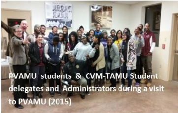
PVAMU students & CVM-TAMU Student delegates and Administrators during a visit to PVAMU (2015)