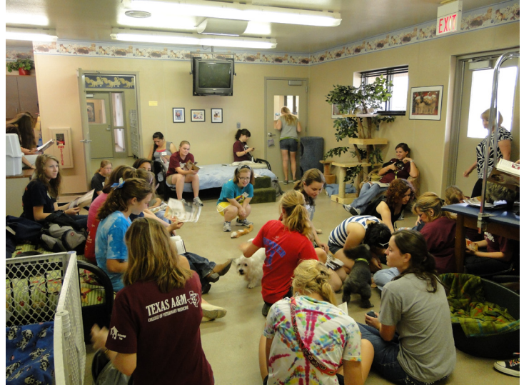
Some of the Veterinary Enrichment Camp attendees