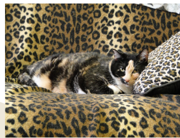
Precious is precious trying to snooze