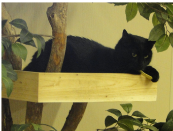
Angie loves the cat tree