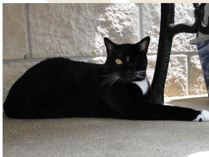
Win is winking at you