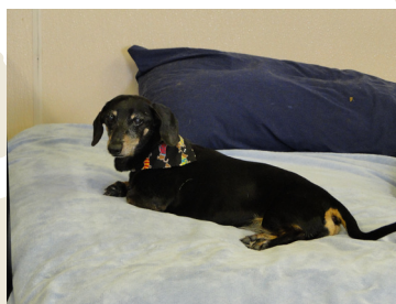
Trixie is the queen of this futon