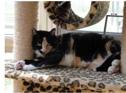
Precious snuggled up in her condo