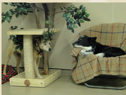
Noah relaxed while Amy scratches her back