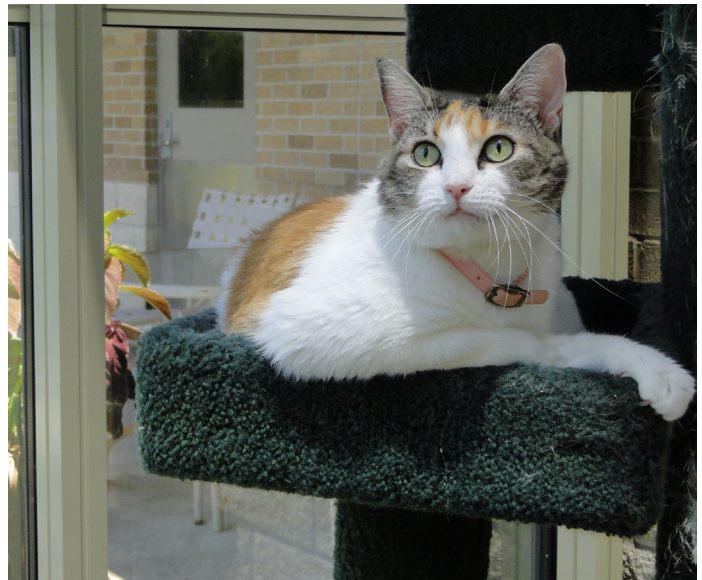
Lucy watching birds in her sunroom