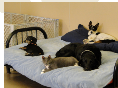
Time for our daily naps