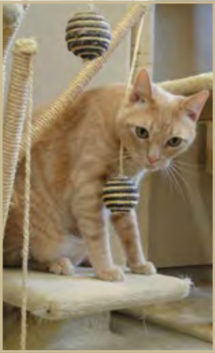
Playtime for Tiger